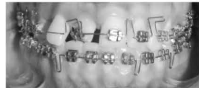
Fig.5. Partially engaged Box Loop.