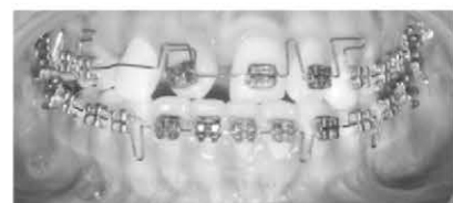
Fig.6. After 6 weeks Box loop fully engaged – canine derotated