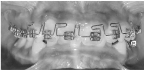
Fig.10.After 6 weeks- Bite opening and Levelling done.