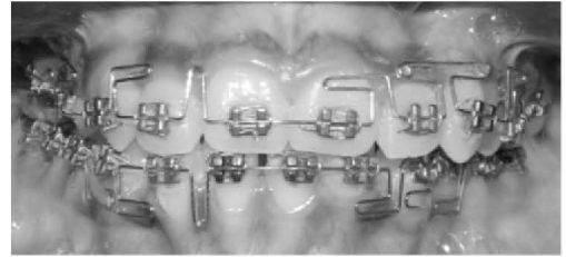
Fig.12.After 6 weeks- Buccally placed canines aligned and bite opened