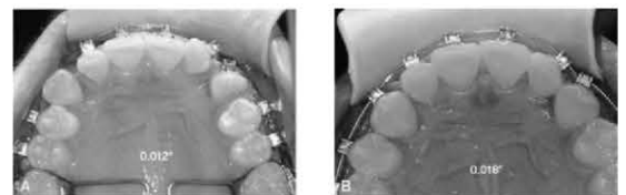
Fig:7(a,b). In these figures the case 1. is compared with another case which is treated with the Damon system in which three consecutive wires are to be used for the derotation of a tooth i.e 012, 018, 016/025