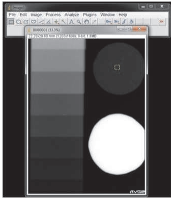
Figure 1: Gray value measurement using a 50 x 50-pixel ROI. ROI was set at each step and the resin disk.