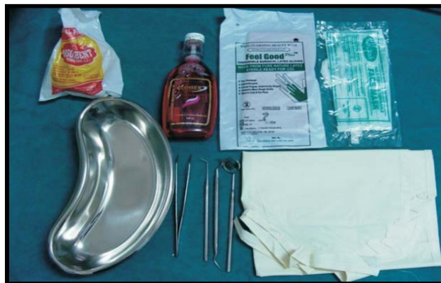
Figure 2: Armamentarium for examination of study subjects