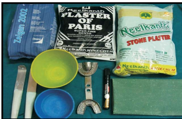
Figure 3: Armamentarium for making impression and obtaining study cast.