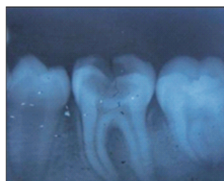
Figure 1: Pre-Operative IOPA radiograph