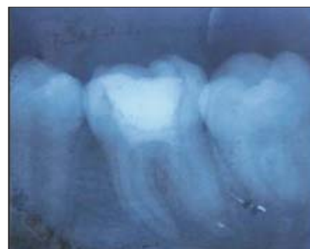
Figure 2: Follow up at 3 months after MTA pulpotomy