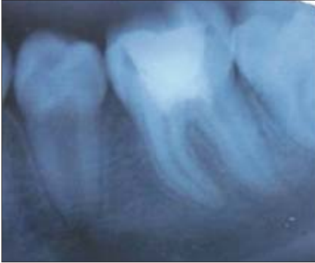
Figure 4: Follow up at 9 months after MTA pulpotomy