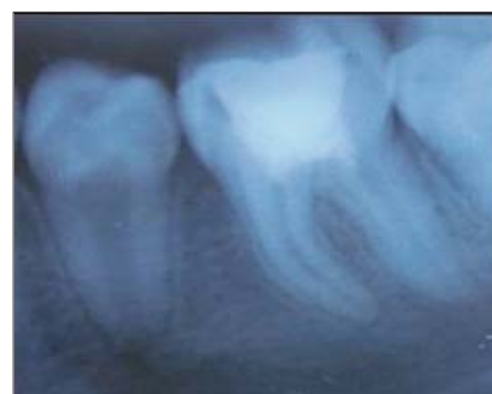
Figure 3: Follow up at 6 months after MTA pulpotomy