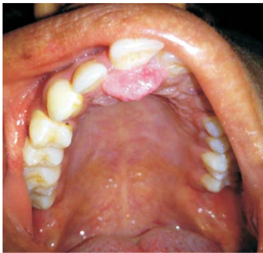
Figure 1 : Intraoral view showing smooth sessile swelling in anterior palatal region

(Figure 1).The patient reported that she noticed the swelling 2 years back, which was of a small lemon seed size and gradually increased to the present size. The patient reported of no symptoms like pain or mobility of the upper incisor. Radiographic examination revealed no bone loss in the same region . Based on clinical and radiographic findings, a provisional diagnosis of a pyogenic granuloma was made. Differential diagnosis included peripheral exophytic lesions such as irritational fibroma, peripheral ossifying fibroma, peripheral giant cell granuloma, peripheral odontogenic fibroma .