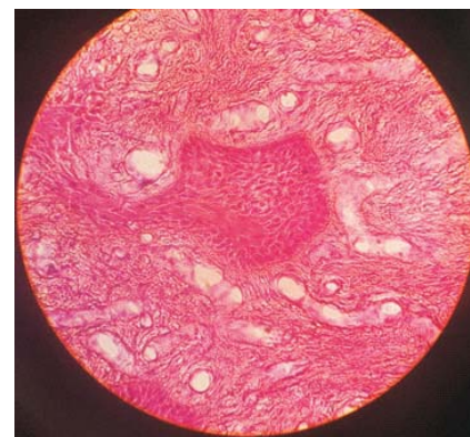
Figure 4: High-power (40 x) Photomicrographic view showing calcification depicted by white arrow (Figure 3 ) along with scattered islands of odontogenic epithelium (black arrow)