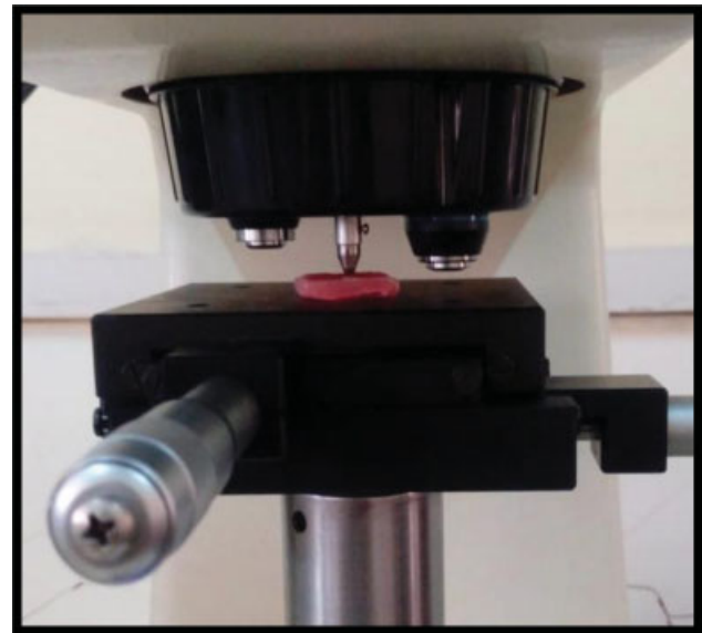
Fig. 2 Sample placed under the indenter.

tubules, leading to greater amount of microhardness reduction in coronal third.