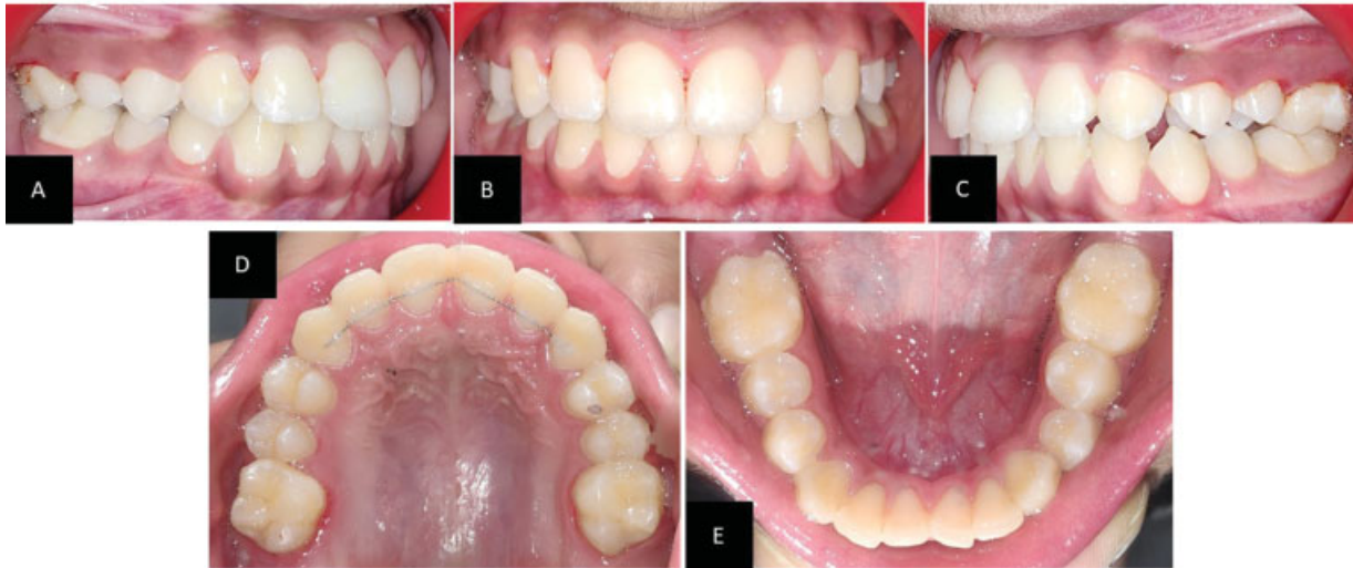
Fig. 5 (A) Posttreatment right lateral view shows Angle's class I molar relation with erupting premolars (B, C) Posttreatment view shows corrected overbite and reduced midline shift. (D, E) Occlusal views of maxillary and mandibular arches.