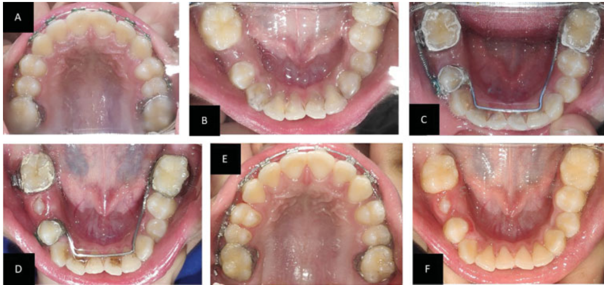
Fig. 3 (A) Maxillary occlusal view shows erupted permanent dentition undergoing fixed mechanotherapy. (B) Mandibular occlusal view shows erupted 1st premolars and space deficiency for right second premolar. (C) Cementation of King Appliance with activated NiTi open coil spring. (D) Space regained and eruption of right second premolar. (E) Closing of spaces in maxillary arch. (F) Debonded mandibular occlusal view.

seen by Vernier caliper on right side of mandibular arch, was found to be 4 mm deficient for eruption of tooth, as the dimension of second premolar on left side of the dental cast was found to be 8 mm mesiodistally. It was decided to gain space on the right side of the arch, using King Appliance space regainer. A modified lingual arch was built, extending from left mandibular first permanent molar to right mandibular first premolar, and was soldered to stainless steel bands of 0.004'' \times 0.150'' and 0.005'' \times 0.180'' , respectively. Another molar band was constructed for right mandibular first molar, using the above band specification itself. An edgewise bracket of 0.022'' \times 0.028'' slot size was spot welded on band of right mandibular premolar band, while a buccal tube of 0.7-mm diameter and 10-mm length was spot welded to the band of right mandibular first molar. The bands and the modified lingual arch are then cemented over the teeth, using luting glass ionomer cement. Once the bands were cemented, a NiTi open coil spring (Rabbit Force USA; 012'' \times 030'' ) was threaded with a 0.018-inch stainless steel wire of length, suitable to span the distance between the right-side mandibular molar and first premolar. The length of open coil was 2 mm greater than the distance between the molar tube and bracket welded over the bands to enable