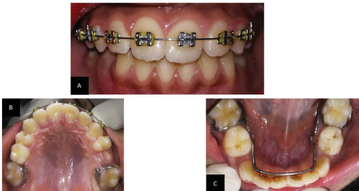
Fig. 2 (A) Intraoral frontal view showing midline shift toward left side. (B) Maxillary occlusal view shows emergence of left second premolar. (C) Mandibular occlusal view shows marked space loss for succedaneous teeth and staining of teeth.

The stage at which the patient presented to us, the space had already been regained, and emergence of maxillary right second premolar was seen, while in mandibular arch, bonded lingual arch was present, and it was planned to continue the treatment as such while we waited for physiologic shedding followed by eruption of premolar. Over the period of one and half year, patient again presented to us with erupted maxillary second premolars, which we included into the fixed mechanotherapy, and erupted mandibular first premolars and left second premolar, while inadequate space was seen to be present for right mandibular second premolar (►Fig. 3A, B). An intraoral periapical radiograph was taken which showed the premolar to be in Nolla's stage 8 of formation (►Fig. 4A). The mesiodistal space available, as