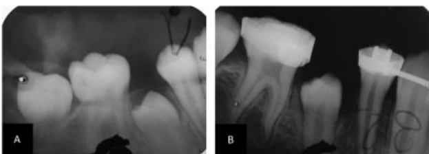
Fig. 4 (A) Intraoral periapical (IOPA) radiograph of blocked mandibular right second premolar. (B) IOPAR shows sufficient space postspace regaining therapy.

Premature loss of primary teeth results in space loss and loss of arch dimensions. Space regaining appliances are considerably less cumbersome and employ simpler techniques to intercept the malocclusion. 7 In the present case, we used a modified lingual arch NiTi open coil space regainer, commonly referred to as King Appliance. 8 Although the appliance was formulated a few decades ago, its use in literature was found to be considerably scarce. Use of King Appliance was preferred over other treatment modalities, as this appliance is a fixed regainer; hence, patient compliance was good. Moreover, light continuous forces employed by the spring causes more bodily movement of the tooth in comparison to mere tipping of the